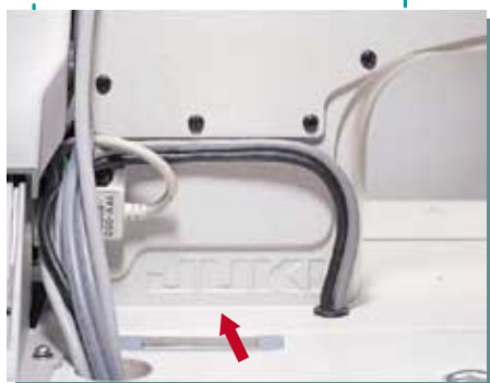
Embossed JUKI mark

● To order, please contact your nearest JUKI distributor.