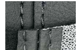
Combination of woven / felt leather