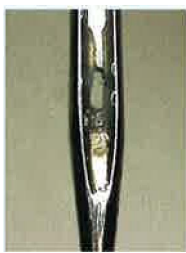
[Upper thread breakage]