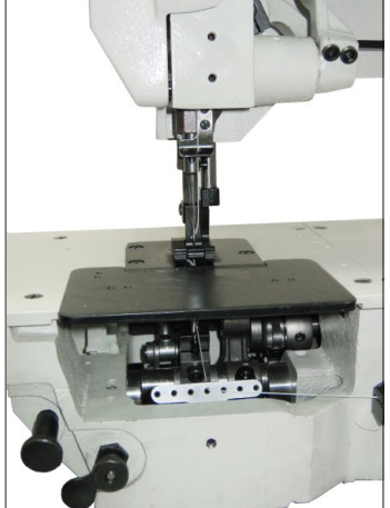
Closeup of 3321