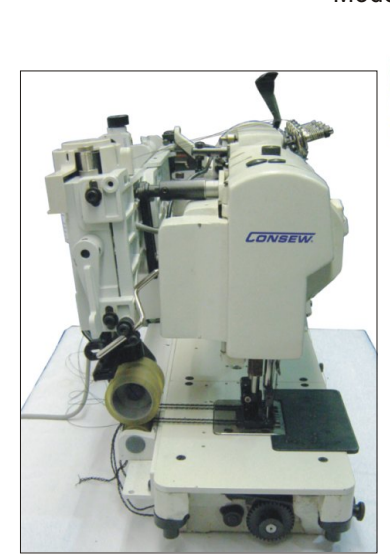
Model 3324-P End View Showing Puller