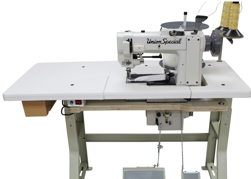
Single Needle, Double Locked Chainstitch Machine with Compound feed and tape binder