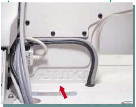
Embossed JUKI mark

• To order, please contact your nearest JUKI distributer.